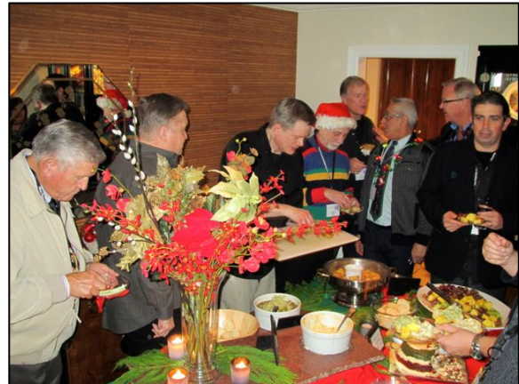
WFPNA Holiday Party