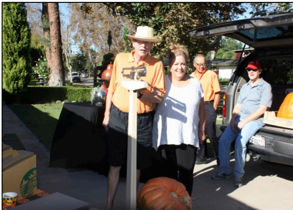
WFPNA Pumpkin Weigh-In Winners